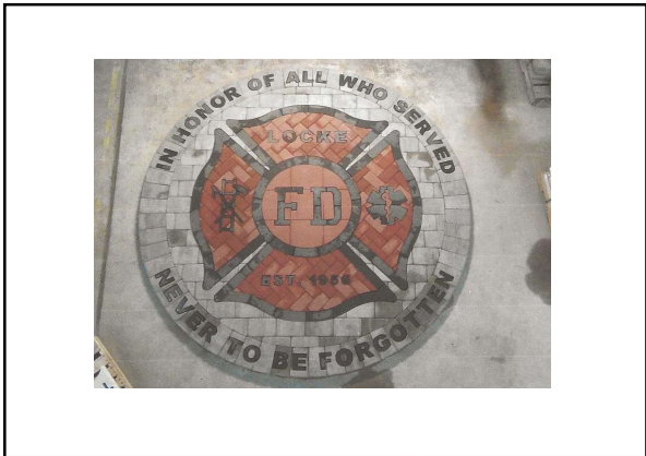
Developing skills to provide a ministry of presence www.FireChaplain101.com