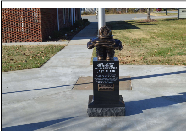
Developing skills to provide a ministry of presence www.FireChaplain101.com